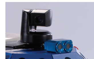
Vision and Mapping